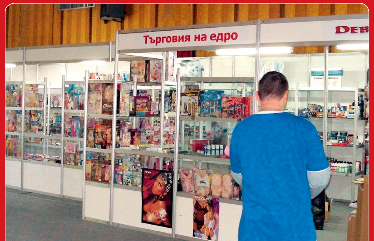
Another writing system, same company: "Debra Net Ltd." at the Bulgaria Eros Show