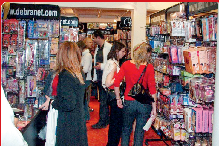
There was a large crowd: "Debra Net Ltd." at the Hungary Erotic Show