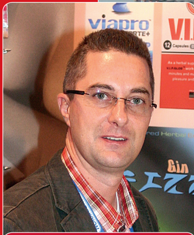
General manager of "Debra Net Ltd." has grand plans