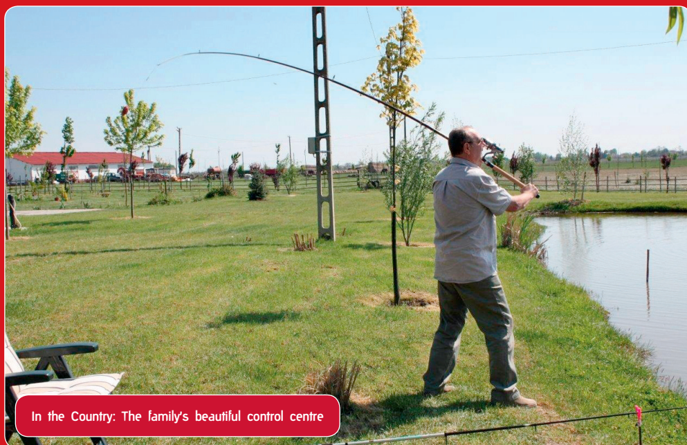
In the Country: The family's beautiful control centre